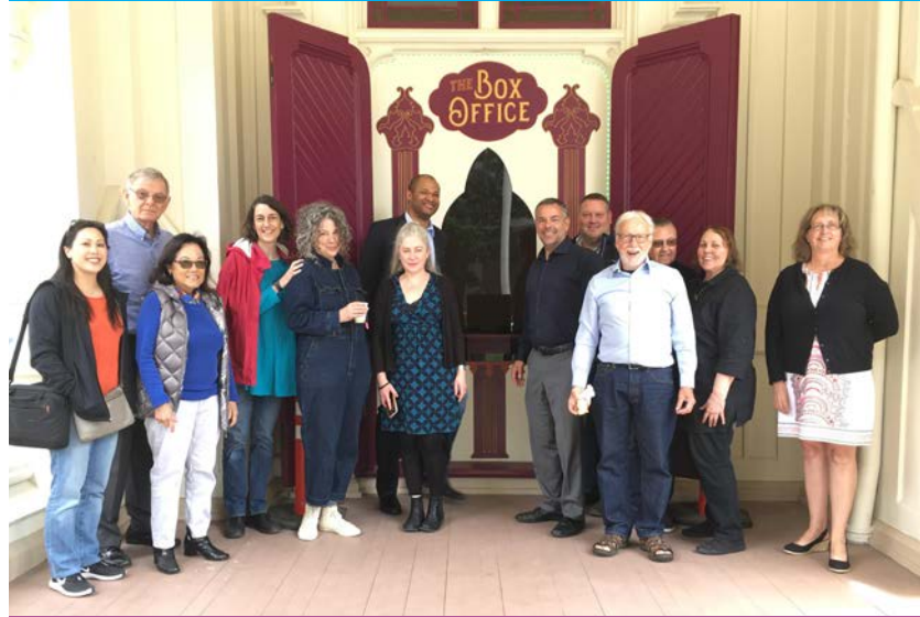
In 2019, we were excited to debut our delightful box office. Housed under the protective roof of the porte cochere, this new feature raises our visibility. Thank you to Arciform, our expert architectural partners in historic preservation, and to Flora Fauna Designs for the conception. This photo features our board of directors and executive director.

The Old Church is a nonprofit concert hall and all-ages events venue. We are a non-religious organization with a dual mission: to preserve and celebrate the building's historic architecture and create music and arts programs that enhance the cultural life of the community.